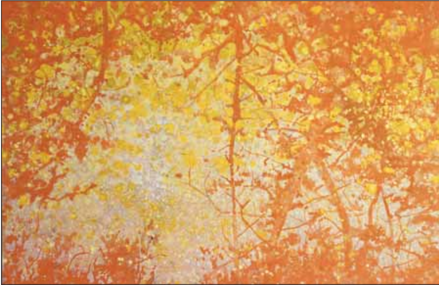
Figure 14. David Korty, Untitled , 2000, acrylic on panel, 33" × 48". Reproduced by permission from the Gwangju Biennale Foundation.