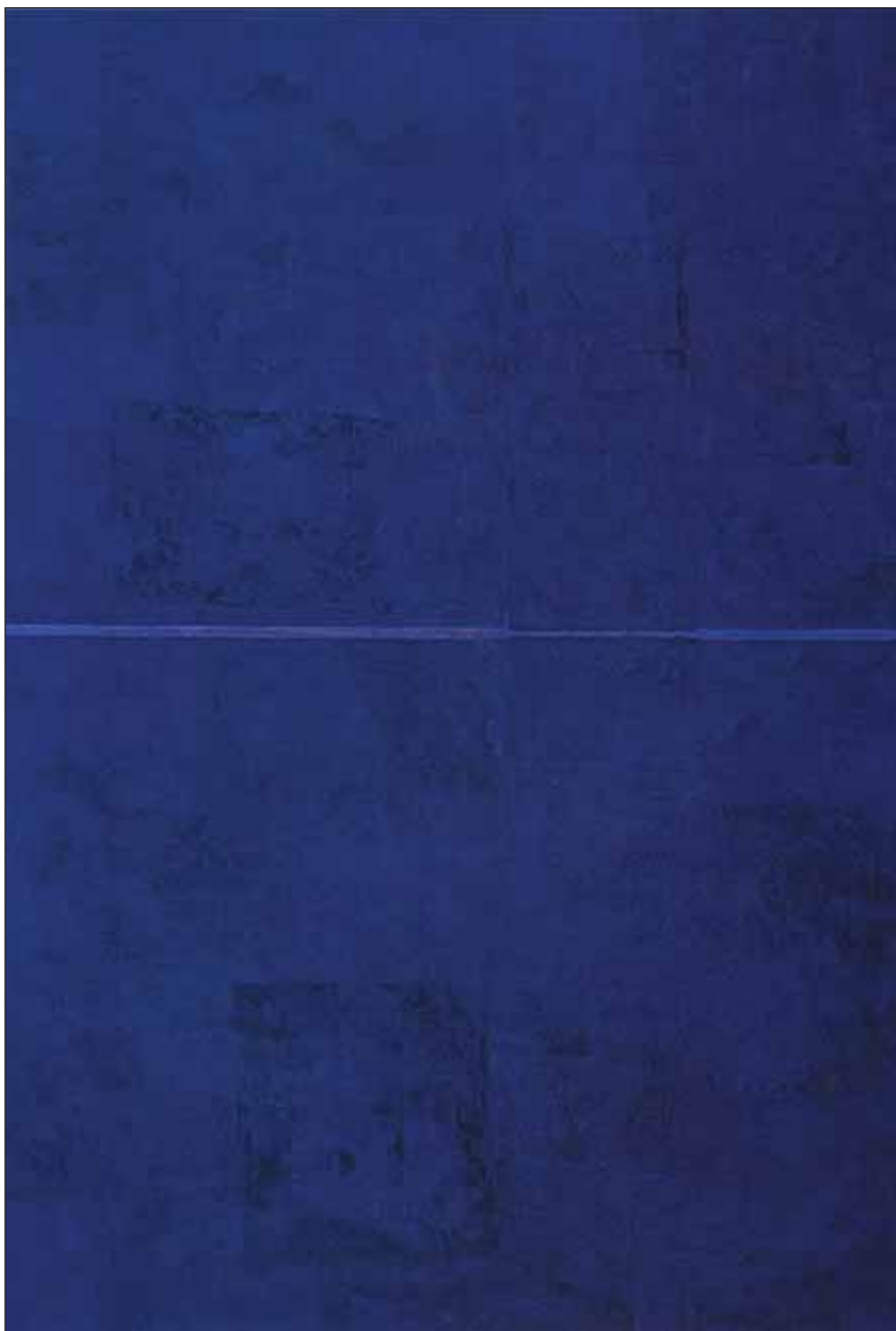
Figure 8. Il Nam Park, Gap , 2001, acrylic and oil on canvas, 194 cm × 30 cm. Reproduced by permission from the Gwangju Biennale Foundation.