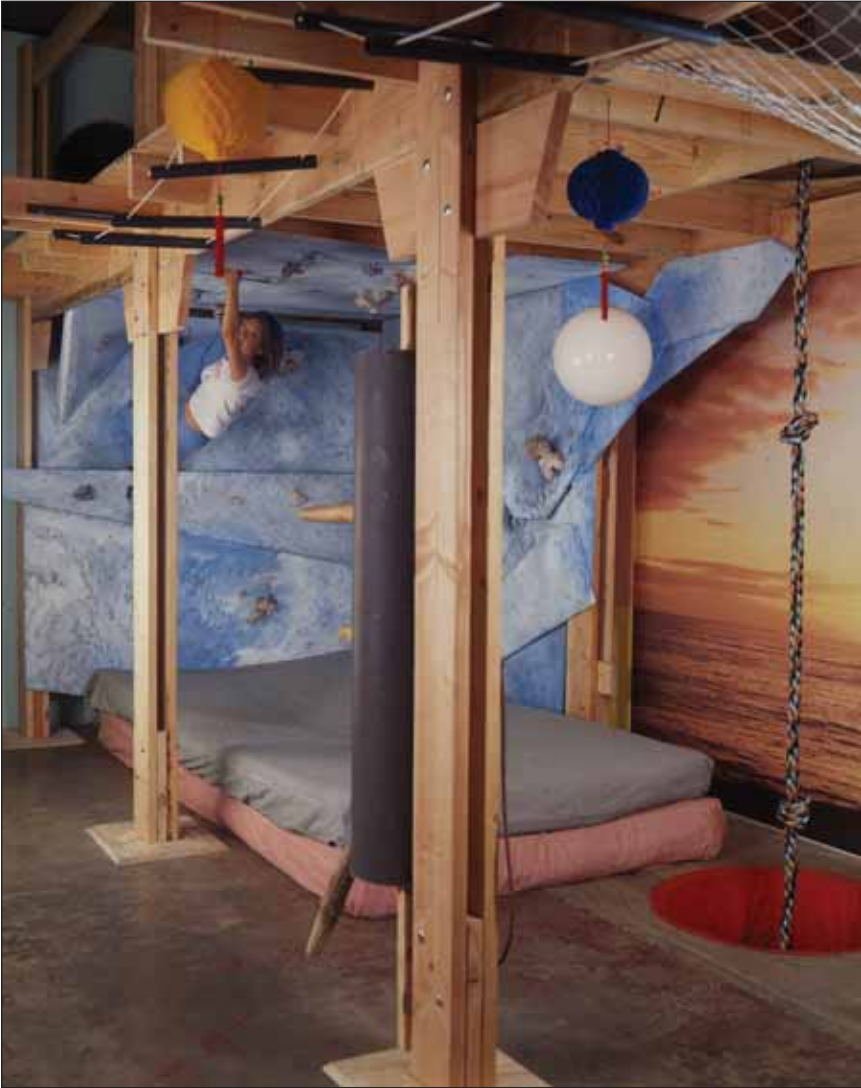
Figure 13. Jennifer Moon, Facility , 2000, installation, dimensions variable. Reproduced by permission from the Gwangju Biennale Foundation.

purposely chose subject matter recounting events that prove significant, not necessarily because they happened, but because they were remembered. Most importantly, the content of their remembered events found their way into a visualized form that became fragments of There . But what about the untold stories?