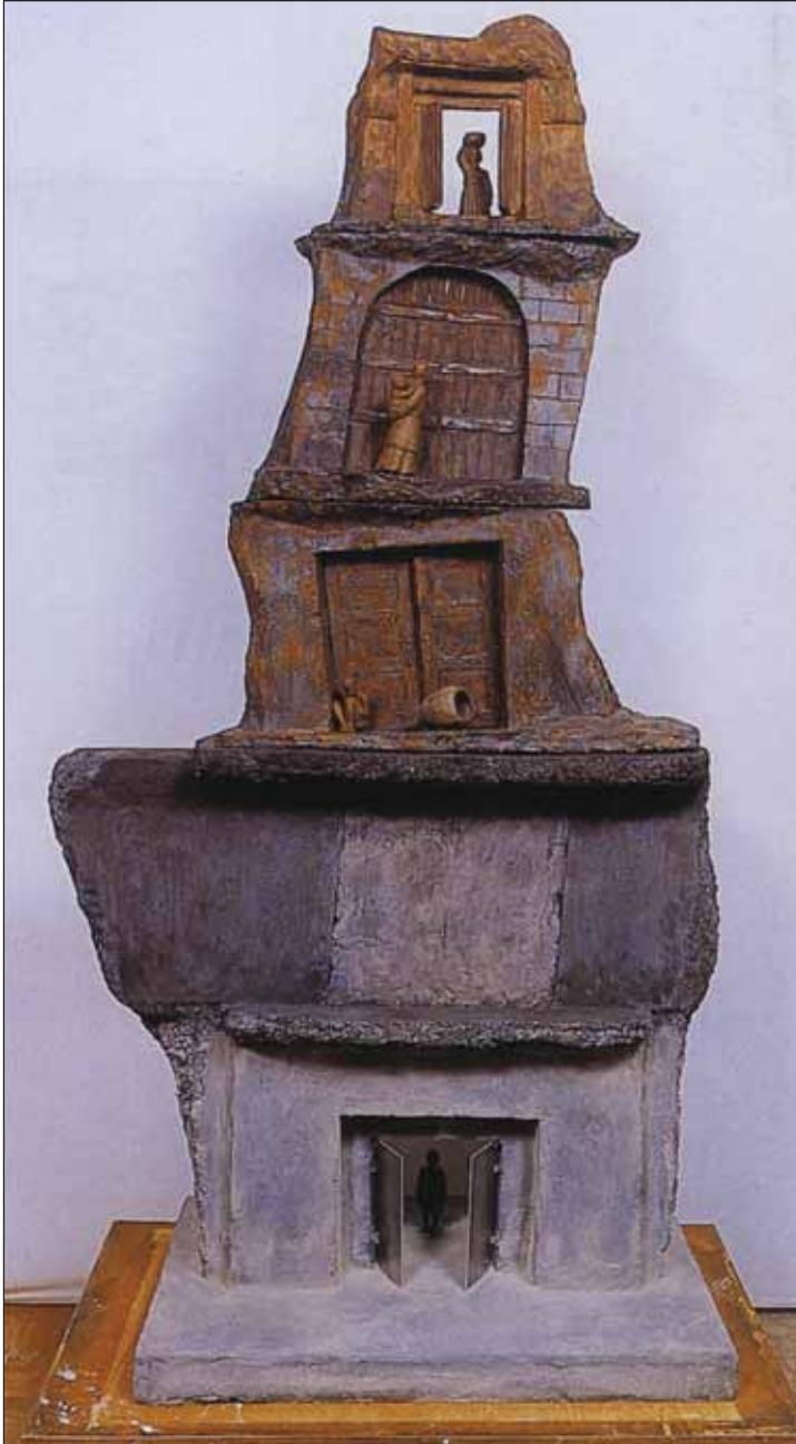
Figure 7. Fung-sok Ro, The Gate , 1994, ceramic sculpture, 150 cm × 69 cm × 48 cm. Reproduced by permission from the Gwangju Biennale Foundation.