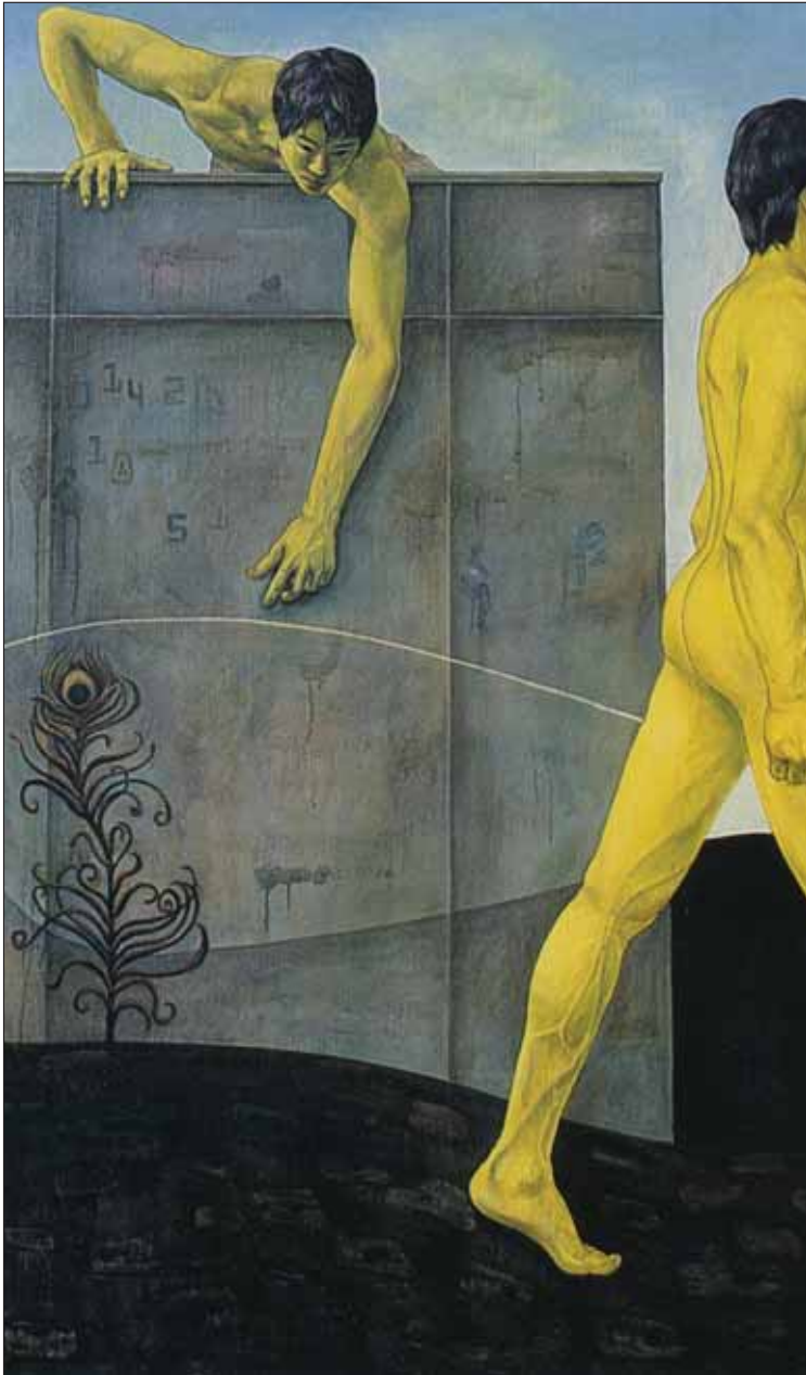
Figure 10. Chöngsuk Kang, Crossing , 2001, oil on canvas, 162 cm × 97 cm. Reproduced by permission from the Gwangju Biennale Foundation. Note: Catalogue misprinted the artist's name as Yong Suk Kim.