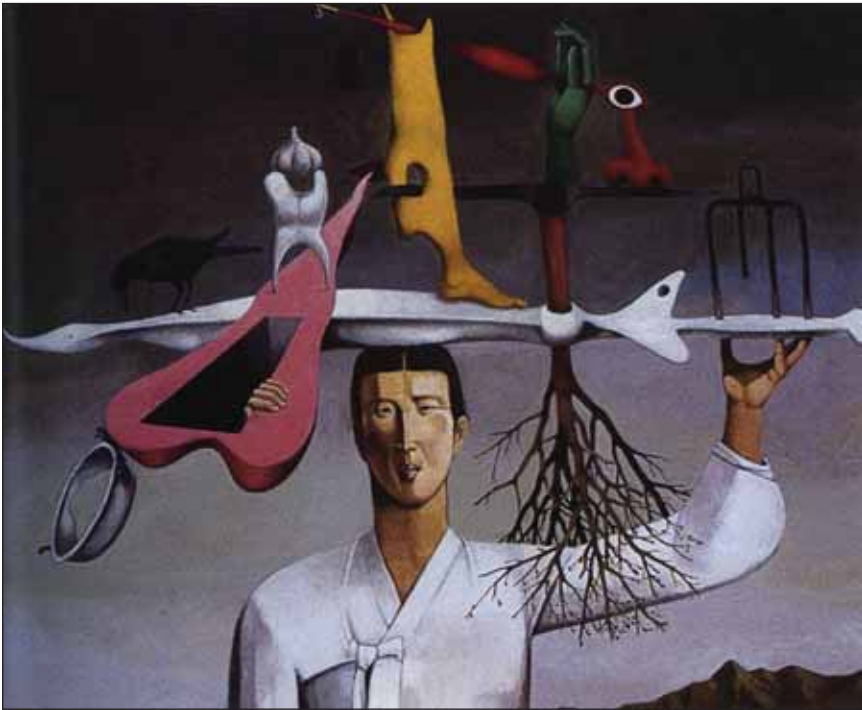
Figure 6. Jun Chae, Leaving Home , 1997, oil on canvas, 91 cm × 117 cm. Reproduced by permission from the Gwangju Biennale Foundation.

or sitting helplessly, curled up with heads placed on their knees— allude to the emasculation felt and disempowerment experienced particularly by Korean Japanese men living in Japan as opposed to Korean men's status within the patriarchal Korean society.