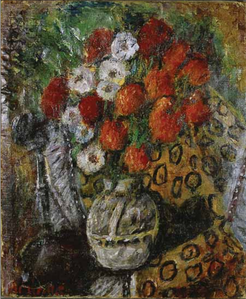
Figure 1. Hee Man Suk, title/date unidentified, oil on canvas, 24" × 20".

An presented a melancholic black and white photograph of an older couple in Reminiscences (figure 2). The setting draws a humbly clothed man and woman in front of a dilapidated wood fence, and the rough texture of the couple's rugulose faces—the effect of years of working the land—is lessened with dimmed lighting that creates a nostalgic effect, powerfully emoting the story of Koreans who fled northward from the peninsula and who were forcibly moved from Vladivostok to Tashkent and Almaty. 60